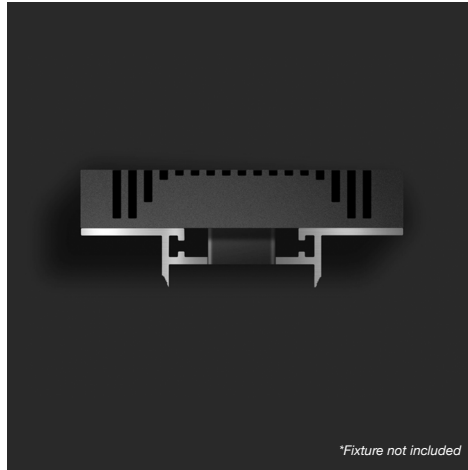
*Fixture not included